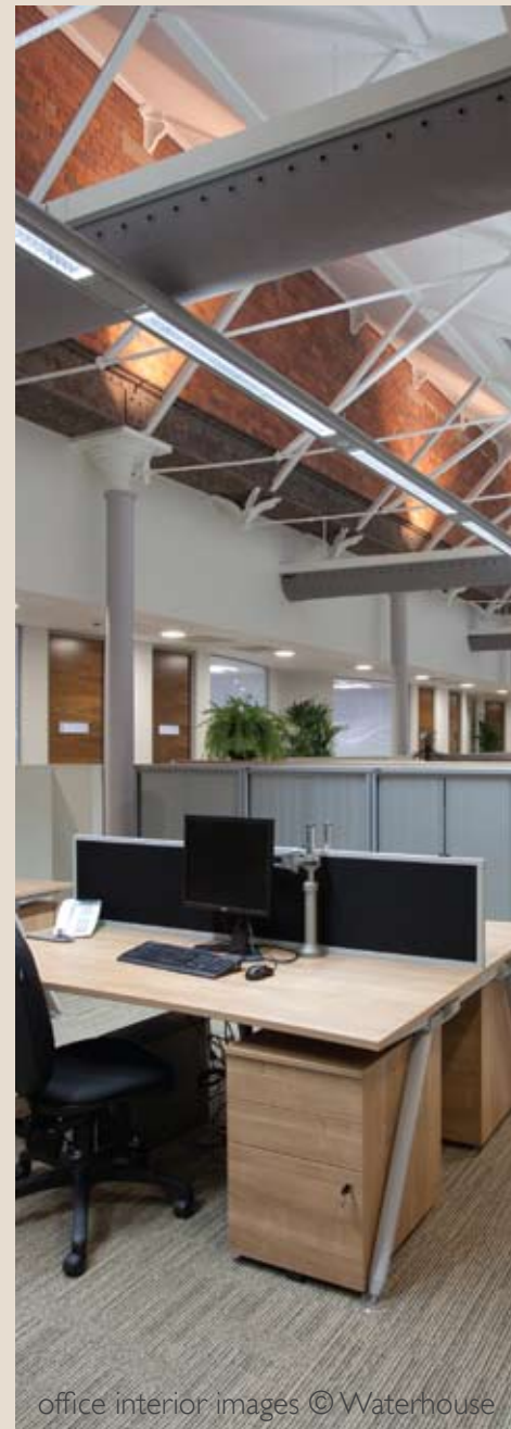
office interior images © Waterhouse